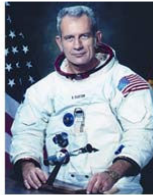
NASA: Donald "Deke" Slayton