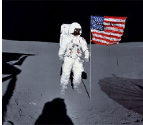
NASA: Dr. Edgar Mitchell

For this article however I want to focus on our astronauts, who for the most part don't talk much about their experiences with UFO's, quite possibly because NASA, which I think stands for, "Never A Straight Answer", has advised them it would be best to not discuss the subject, or they have refused to go public, fearing ridicule and condemnation.