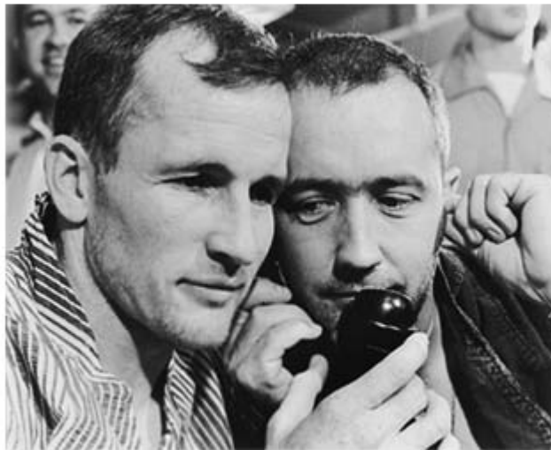
Gemini 4 astronauts Edward H. White II (left) and James A. McDivitt listen to the voice of President Lyndon B. Johnson as he congratulated them by telephone on the successful mission. They are shown aboard the aircraft carrier U. S. S. Wasp just after their splashdown recovery from the Atlantic Ocean.

In June 1965, astronauts Ed White (first American to walk in space) and James McDivitt were passing over Hawaii in a Gemini spacecraft when they saw a weird-