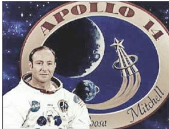
NASA: Dr. Edgar Mitchell

Mitchell said, “the UFO story is so secret that even presidents and top politicians, including Jimmy Carter, Gerald Ford and former Arizona Senator Barry Goldwater, were denied access to the “black operations files,” and theorizes that even the government may not be in control of the information or technology.”