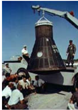
NASA: Mercury Capsule

Dr. Mitchell is not the only astronaut that has either seen UFOs or believes they are real and may represent contact with other worlds. Gordon Cooper, one of our initial astronauts was an outspoken believer in UFOs, prior to his death in 2004. Cooper claimed to have first sighted UFOs as a young Air Force pilot in Germany in the 1950s, and like Mitchell claimed that the government hid the truth from the public. Cooper and Mitchell are joined by others such as Mercury astronaut Donald (Deke) Slayton, and at least two former Soviet cosmonauts, Yevegni Khrunov, a Soyus-5 pilot, and Salyut-6 space station member Maj. Gen. Vladimir Kovalyonok, all claiming at one time or another to have seen UFOs, or saying that they are certain the Earth has been visited by aliens and their spacecraft.